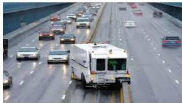
Fig 2. Road Divider using vehicle

The concept of movable road dividers was from the 90's, the reason was that there was traffic congestion from that period. At that period the machine was called as zipper machine, which is used to shift the divider from one lane to another lane. It was introduced in earlier 90's and the first working model of zipper machine was bought by Hawaii department of transport in late 90's. The machine contains a s-shaped inverted conveyor channel which lifts the barrier segment weighing almost 450kgs. The minimum length of the machine is 100feet. The barrier segment is attached to the machine and whenever there is traffic congestion the machine will move and along with the machine the barrier segment that contains the divider also moves resulting in the width of the lanes. In the proposed model, we are not using a machine and operating it manually rather operating it automatically by using two dividers namely normal and extended dividers. In this paper we place the ultrasonic sensor to one side of the road to detect whether there is any traffic congestion or not, if there is a congestion then the extended divider raises up and normal divider is set to ground level, else the normal divider is raised up and extended divider is set to ground level. And if there is congestion then a message is sent to the nearby traffic control police stating that traffic congestion has occurred. So this is simple and can replace the heavy machines.